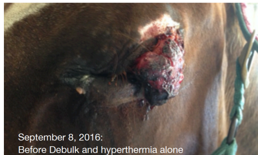
September 8, 2016: Before Debulk and hyperthermia alone

Brandon Equine Medical Center has been treating a particularly aggressive fibroblastic sarcoid for approximately a year and a half, with optimistic results achieved only recently using multimodal therapy. The 17 YO quarter horse mare was first seen back in September 2015 after a fibroblastic sarcoid on the outside corner of her left eye had been treated elsewhere with 5-FU, Xxterra, Carboplatin injection, and debulking. At that time, it was again debulked, then several Cisplatin beads placed intratumorally as chemotherapy. Over the next year, the sarcoid continued to recur after various treatments including further debulking, cisplatin beads, cryotherapy, Chinese herbs, and Aldara cream.